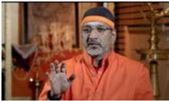
Perspective of an Institution: Chinmaya Mission (RMN_013)