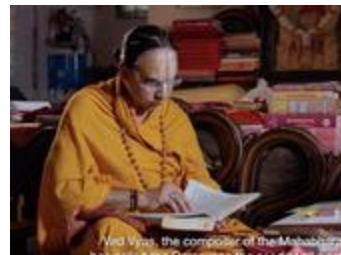
Ayodhya: The Ethos of Rama (RMN_015)