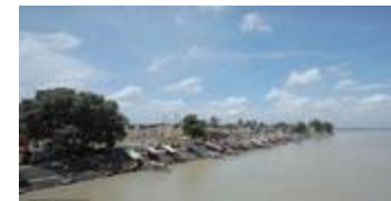
Ayodhya: The Story of Sarayu (RMN_016)