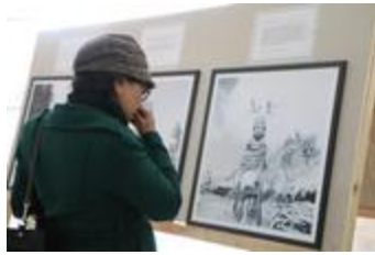
A visitor at the exhibition (at Shillong) of photographs by Dr. Verrier Elwin, 2016 (SC_07)