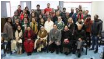
Participants and Organizers on the last day of the Conference (SC_11)