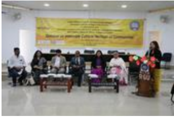
Opening session of the INTACH-AITS workshop (AP_1)