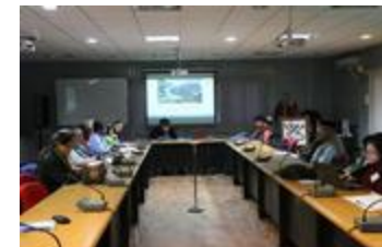
Conference session in progress during National Conference at Wildlife Institute of India (HIMA_4)