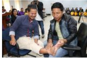
A Galo community Healer demonstrating his skills (AP_7)