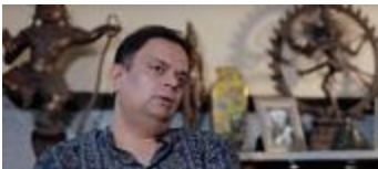
Ayodhya: Madhuropasana (RMN_017)