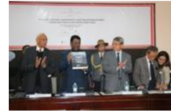
Release of the Book - 'Shadow and Light, A Kaleidoscope of Manipur' (SC_09)