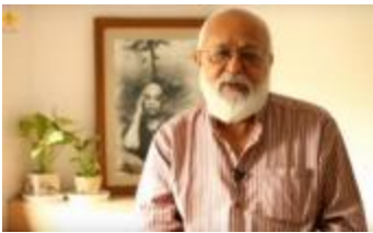
'The Ganga as it flows' by Professor Pushpesh Pant, Part-2 (LIV002)