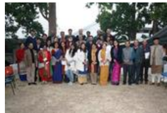
Participants and delegates of the conference posing for a group photo (HIMA_15)