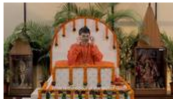
Perspective of an Institution: Chinmaya Mission (RMN_014)