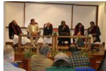
Session at Don Bosco Centre for Indigenous Culture, Shillong (SC_02)