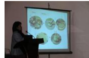
Lecture by Queenbala Marak (SC_03)