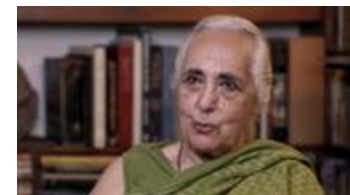
Perspective of an Historian: Dr Romila Thapar (RMN_006)