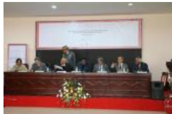
Inaugural session of the Conference on Oral Traditions: Continuity and Transformations - Northeast India and Southeast Asia, Shillong (SC_01)