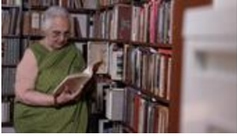
Perspective of an Historian: Dr Romila Thapar (RMN_007)