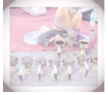
Man preparing the camphor lamps which will be lit for Ganga aarti. (IMAG0551_1)