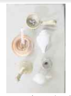
Conchs, copper pot for water, brass lighting pot and bell used in worship. (IMG_4550)