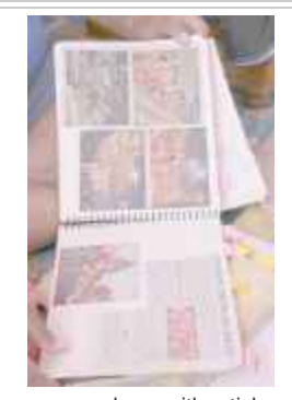
Newspaper colums with articles and pictures on Dev Deepawali (IMG_4489)