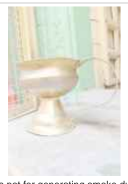
Brass pot for generating smoke during ganga aarti. (IMG_4536)