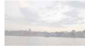
Evening view of the Ganga (IMAG0278)