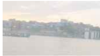
Evening view of the Ganga (IMAG0245)