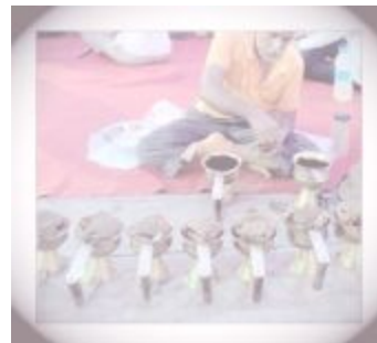
Man preparing the camphor lamps which will be lit for Ganga aarti. (IMAG0551_1)