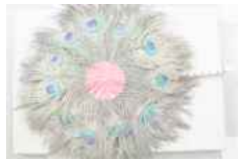
Chamara (fly-whisk) made of peacock feathers. (IMG_4546)