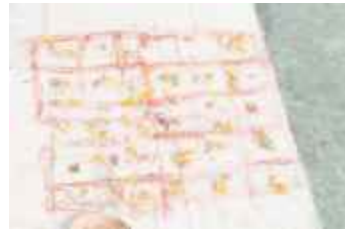
Worship platform for a special purpose (IMG_4470)