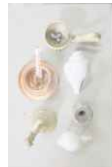
Conchs, copper pot for water, brass lighting pot and bell used in worship. (IMG_4550)