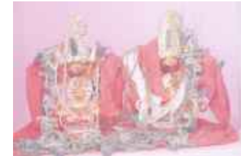
Adorned idols of god and goddess. (IMG_4497)