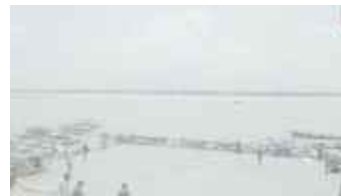
View of Ganga from the Ghat (IMAG0147)