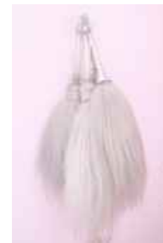
Chamara (fly-whisk) used in the worship hanging on the wall. (IMG_4491)