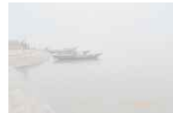
Boats at the Ghat (DSC_4419)