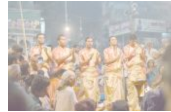
Group of priests chanting hymns as part of Ganga aarti. (DSC_4043)