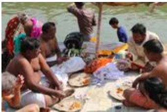
Pind daan at the Ghat in Varanasi (Van_CR_020)