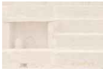
Stone idols at the ghat in Banaras (DSC_4405)