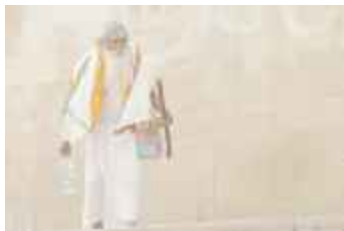
A sadhu at the ghat (IMG_0115)