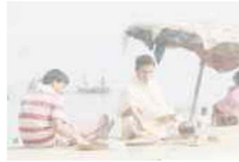
Worship at the ghat (IMG_9303)