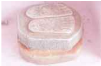
Silver feet representing God (IMG_4492)