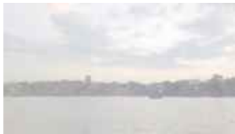
Evening view of the Ganga (IMAG0279)