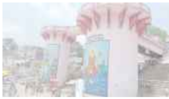
Ghat of Banaras (IMAG0155)