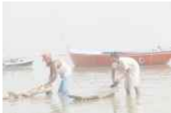
Washing clothes at the ghat (IMG_4441)