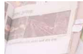
Newspaper clipping showing beauty of ghat on the occasion of Dev Deepawali. (IMG_4487)