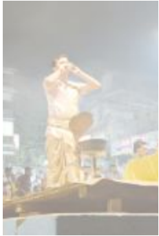
A priest blowing a conch as part of Ganga aarti. (DSC_2441)