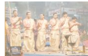
Group of priests chanting hymns as part of Ganga aarti. (IMG_0199)