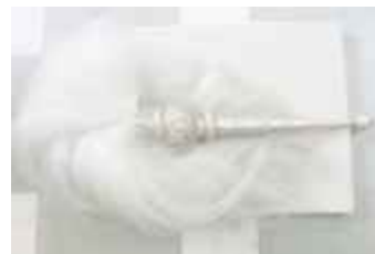
A chamara (fly-whisk) made of silver handle (IMG_4549)