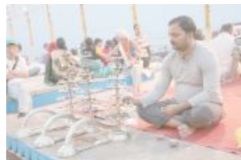
Multi tiered oil lamps being readied for Ganga aarti. (IMG_0175)