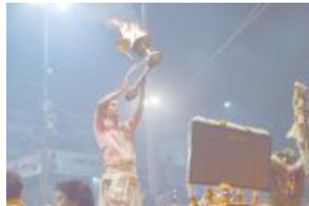
A priest continuing with the Ganga aarti with lit camphor (DSC_4018)