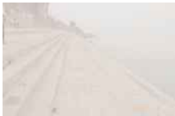
Ghat of Banaras (DSC_4423)