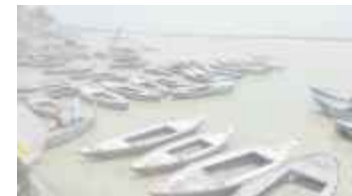
Boats docked at the bank of Ganga (IMAG0149)