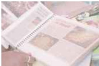
Newspaper article on Dev Deepawali. (IMG_4488)