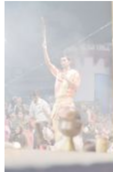
A priest chanting mantras as he proceeds with Ganga aarti. (DSC_4032)