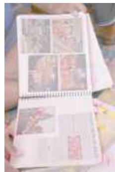
Newspaper columns with articles and pictures on Dev Deepawali (IMG_4489)