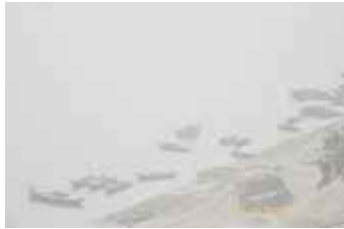
Boats at the pier in Banaras (DSC_4322)