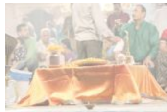
Items set up before the aarti rituals may begin. (IMG_0188)