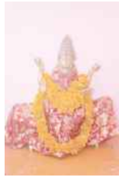
Idol of goddess ganga decorated with marigold. (IMG_4494)