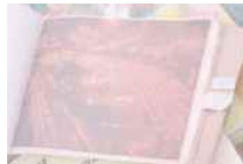
A picture showing series of lighting pots arranged over the steps of ghat on the occasion of Dev Deepawali. (IMG_4486)