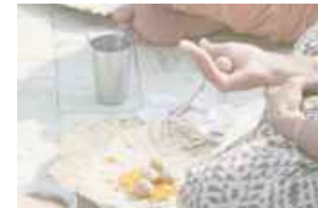
Ghat and Ganga (IMG_4476)