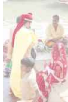
A newly married couple at the ghat (IMG_4474)