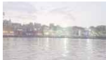
Ghat of Banaras (IMAG0288)