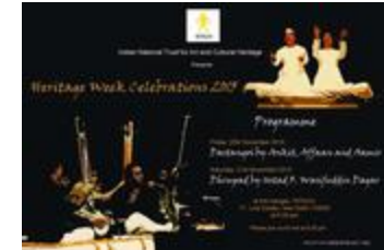
Dastangoi and Dhrupad performances at the Aangan, INTACH (POS001)