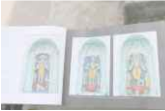
An album depicting gods and goddesses with details (IMG_4563)