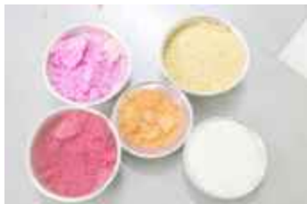
Colours and rice used for decoration and worship. (IMG_4539)