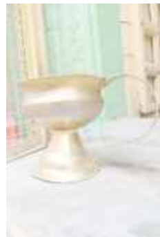
Brass pot for generating smoke during ganga aarti. (IMG_4536)