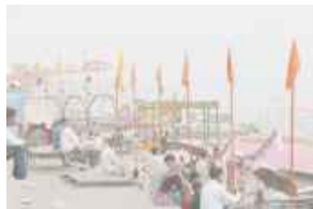
Dashashwamedh ghat (GS005)