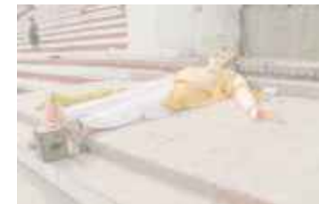
Large idol of Bhishm (IMG_0104)