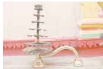
Multi tiered lighting pots for ganga aarti. (IMG_4537)