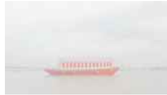
Boat in traditional design on the Ganga (IMAG0277)