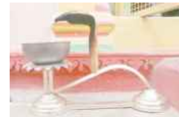
Brass, snake hooded lighting pot for ganga aarti. (IMG_4538)