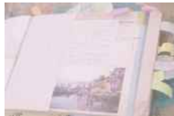
A page showing a column of ganga ghat in Japanese. (IMG_4485)