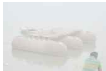
Floating bridge at the ghat in Banaras (DSC_4410)